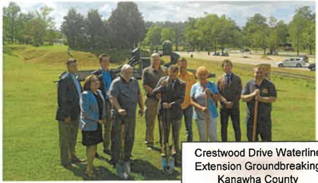
Crestwood Drive Waterline Extension Groundbreaking Kanawha County