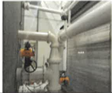
Putnam PSD Water Plant Expansion