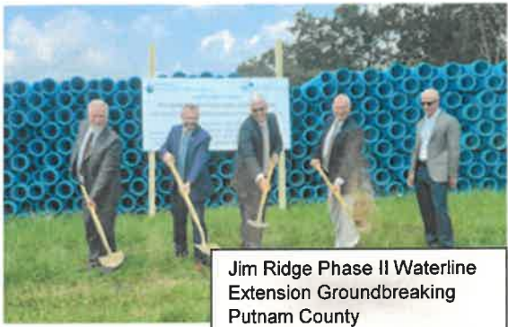
Jim Ridge Phase II Waterline Extension Groundbreaking Putnam County