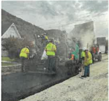
East Reynolds Avenue Belle