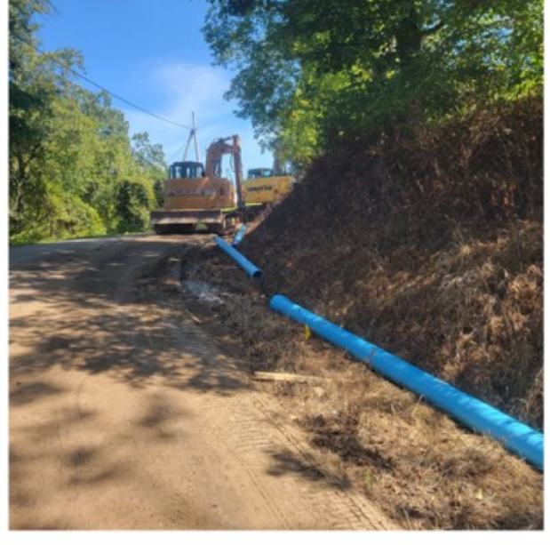
Jim Ridge Phase II Waterline Extension is a $3.8 million dollar project that will serve 54 families. *Pictured on the right

Jim Ridge Phase II Waterline Extension Groundbreaking