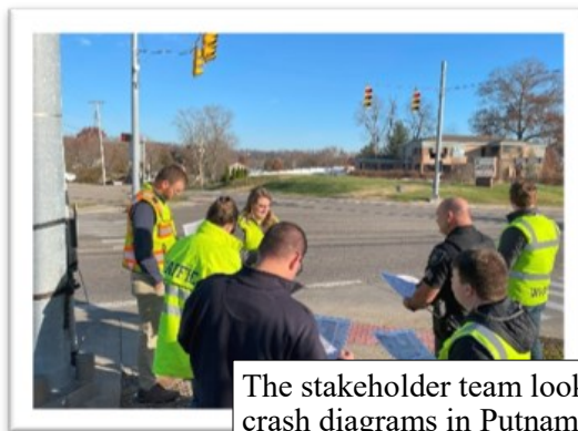
The stakeholder team looks over crash diagrams in Putnam County.

The Regional Intergovernmental Council Metropolitan Planning Organization (RIC MPO) began its process to implement the RIC MPO Comprehensive Safety Action Plan (CSAP) by completing one of the key elements of a Road Safety Assessment (RSA), which includes an in-person site visit. The RIC MPO CSAP highlighted intersections and pedestrians as emphasis areas in the effort to reach the RIC Policy Board's vision of zero traffic-related deaths and serious injuries in Kanawha and Putnam counties. As a result, using statistical hotspot mapping techniques, a list of intersections suggested for study was produced based on the number of crashes and their severity associated with a specific location. Furthermore, the RIC MPO CSAP ranked corridors based on design elements that serve as statistically significant explanatory variables for the likelihood of a crash to occur involving a pedestrian.