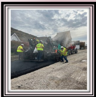
Town of Belle East Reynolds Avenue