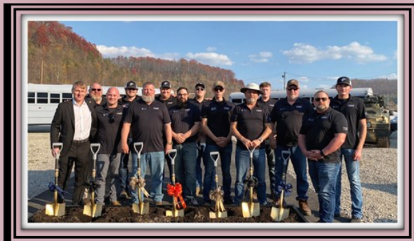
CMI2 Groundbreaking in Clay County at the former Fola Coal Company Site