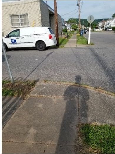
Image: A portion of sidewalk that will be renovated for ADA compliance as a result of the grant award at the Grosscup Ave and 12 th Avenue intersection adjacent to the United States Postal Service in Dunbar.

Transportation Alternative and Recreational Trails Program grants are a set-aside from funds from the Surface Transportation Block Grant Program. These are federal funds are intended as a continuation of the former Transportation Alternative Program. The national total for this program is $850 million.